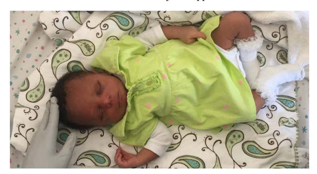
This is why we do what we do!

We wish to offer our heartfelt thanks to all of our donors, without whom none of the work at Maison de Naissance would be possible, and we hope you continue on this journey with us as we strive to do ever more with your support in 2019!