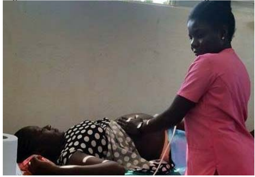
Cervical Cancer Screening Will Be a Part of Routine Prenatal Care

There are three phases to this program. Phase one (early 2020), "See and Treat", which uses an acetic acid detection test, and thermo-cauterization to remove the cancerous cells. Phase two (Late 2020, early 2021) will be to set up remote "see and treat" outpost locations, using portable equipment in existing structures (schools, churches, medical clinics). Women who need additional screening will be referred to Maison de Naissance for lab tests. Phase three (estimated in 2022) will be the introduction of an HPV vaccination program, to provide prevention in addition to screening and treatment. This phase will be incorporated into inhouse and outpost treatment programs, for all patients and their family members, male and female between the ages of 11 and 46, to ensure maximum coverage.