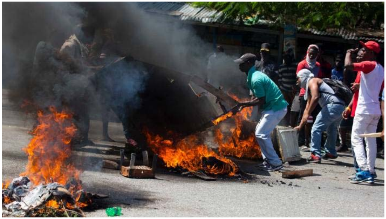
"As the truck was new and did not have a Maison de Naissance logo to prove it was our vehicle, I printed out a paper with our logo on it and put it in the windshield. It was a very difficult time for myself and for all of the staff who live in Les Cayes, especially.

"I remember one day, as we arrived at a bridge they threw a lot of rocks at the truck, and the driver had to turn around quickly while everyone in the truck had to duck below the windows in case a rock hit them. We encountered another roadblock, but fortunately, the husband of a woman who gave birth at MN was there, and when he saw the paper MN logo in the windshield, he gave strict orders to let us through."